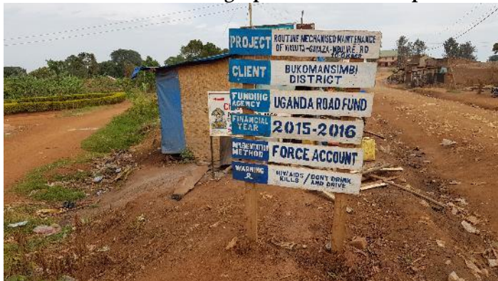
Ch. 0+000: Project information signage