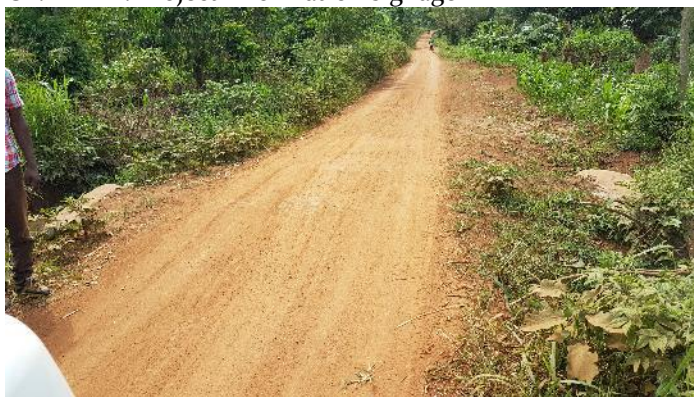
Ch. 5+100: Inadequate compaction of culvert backfill