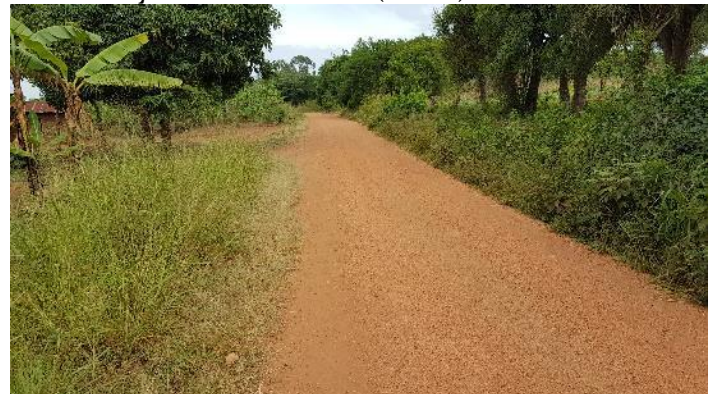
Ch. 1+400: Poor routine manual maintenance