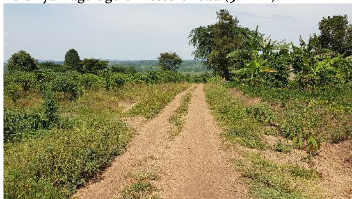
Ch. 0+800: Poor routine manual maintenance