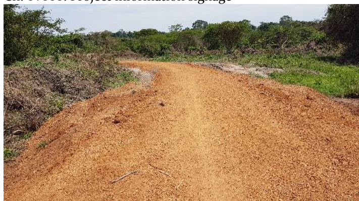
Ch. 7+700: Lack of compaction for borrowed material