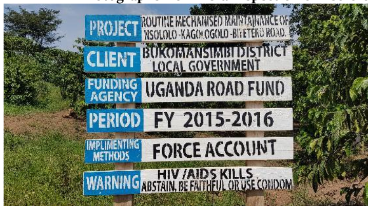
Ch. 0+000: Project information signage