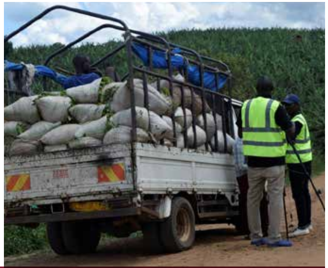
Western Uganda: Road user satisfaction survey exercise in Bushenyi along a Community Access Road