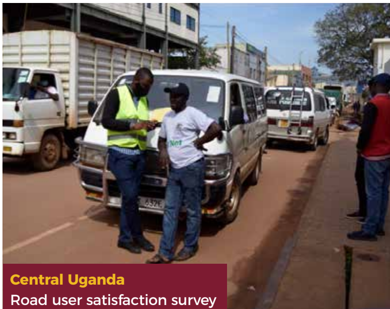
Central Uganda Road user satisfaction survey exercise in Industrial area