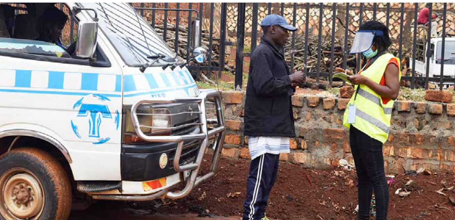
2021 Road User Satisfaction Survey enumerator talks to a taxi driver in Kampala

A sample of 6000 road users from 7 road user groups: pedestrians, cyclists, motorcyclists, passengers, SUV/saloon car drivers, bus/matatu drivers, and truck drivers were targeted during the survey. The overall objective of the RUSS is to provide accountability and a monitoring mechanism through which road users give feedback to providers of services in the road sector. Results will be released soon.