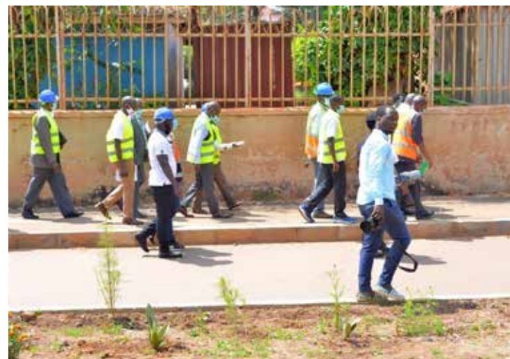
Our Special projects: Centenary Park lane road tour by URF Board and KCCA ED