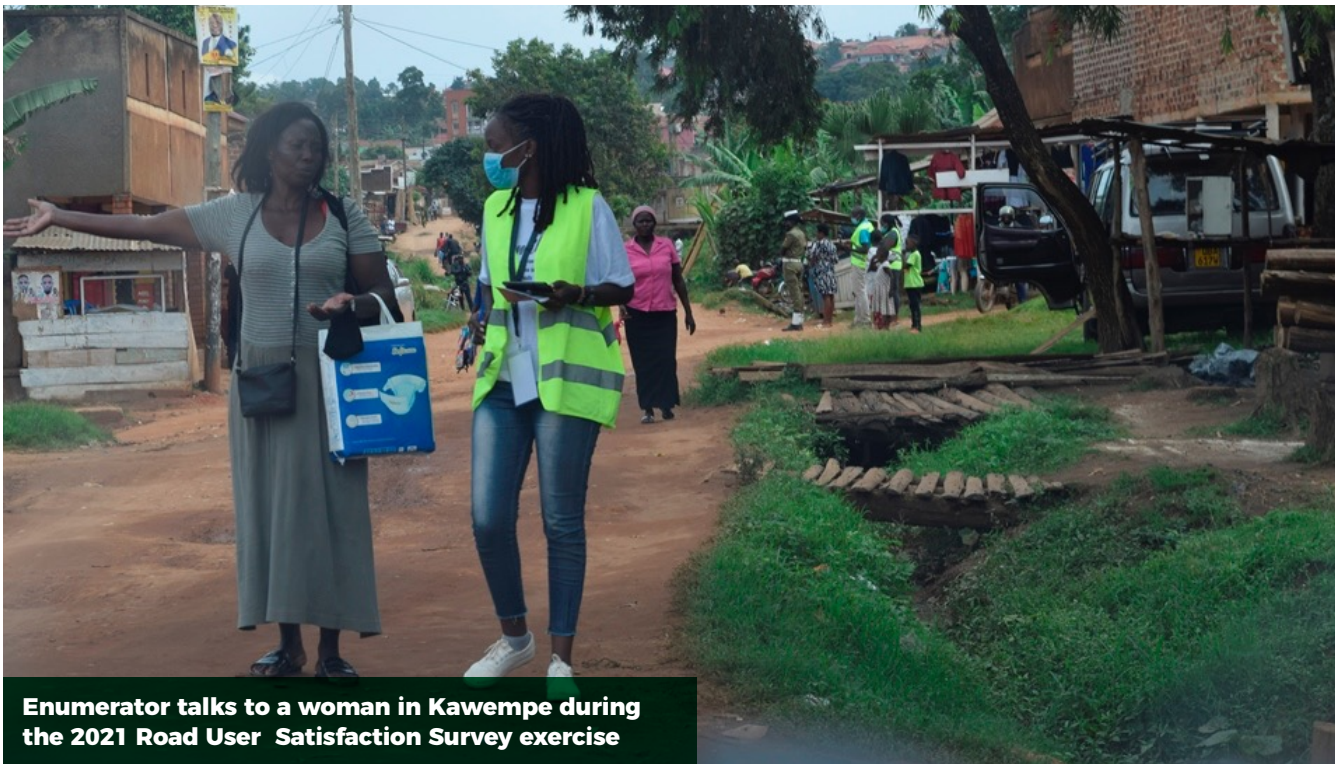
Enumerator talks to a woman in Kawempe during the 2021 Road User Satisfaction Survey exercise