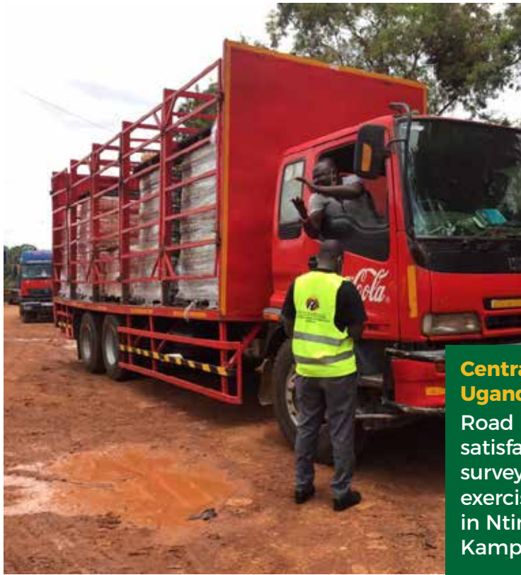
Central Uganda Road user satisfaction survey exercise in Ntinda, Kampala